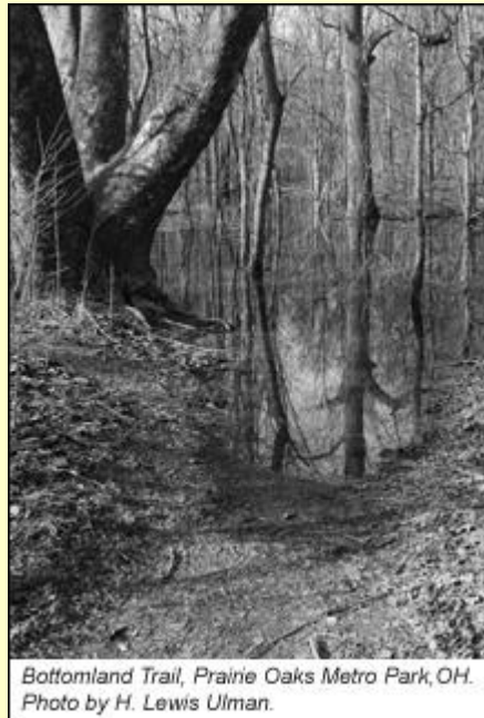
Bottomland Trail, Prairie Oaks Metro Park, OH.

Canada will also see relevant non-ALECC conferences this year in Montreal at the end of May (the annual conference of the Environmental Studies Association of Canada); in Calgary in October ("Under Western Skies: Climate, Culture, and Change in Western North America"); and again in Montreal in November (the 14th annual meeting of the International Association of Environmental Philosophy). Anecdotally, I'm hearing from colleagues across the country that this year has seen a marked jump in the number of graduate student applicants who want to work in the literature and environment field. Not only are we seeing exciting work in the discipline, in other words, but we're also seeing more and more people who want to participate in this work.