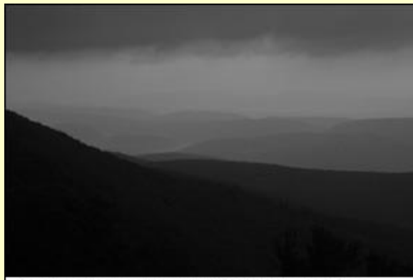
Along the Allegheny Front, Dolly Sods Wilderness Area, West Virginia.