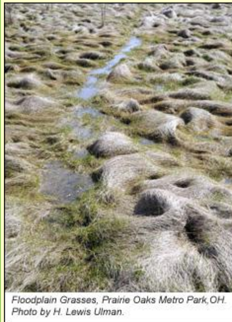
Floodplain Grasses, Prairie Oaks Metro Park, OH.

I found those connections again with my latest project, Soul of a People , about the 1930s through the eyes of people on the Writers' Project all across America. This was during the Depression, when people were by necessity uprooted more than ever before (as in the 1937 film Make Way for Tomorrow , now out on DVD). Some of these people ended up on the Writers' Project relief rolls as their last hope. They were assigned the task of writing about their hometowns and states for the WPA guides, and they rediscovered those places. In Nebraska, a hobo novelist came back after several years knocking around North America on the rails and ended up with the job of editing the WPA guide to Nebraska. And that's how he came finally to see the place. You find the same kind of engagement by Kenneth Rexroth in California, and John Cheever in New York, and of course Zora Neale Hurston in Florida, and Meridel LeSueur in Minnesota. In some cases, I'm sure, it saved their lives.