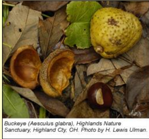
Buckeye ( Aesculus glabra), Highlands Nature Sanctuary, Highland Cty, OH.

For too long, I watched my mother's health slip steadily, the result of an October stroke that struck like a first hard frost, changing her forever. Years later, my mother found relief at last, delivered from the body's duties, released like a leaf in autumn.