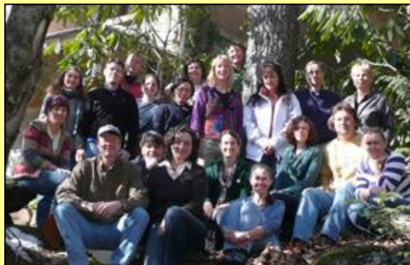
2010 Officer's Retreat Participants in Montreat, NC.

On the weekend of February 19-21 in Montreat, NC (just outside of Asheville), 18 ASLE officers and coordinators and a couple of guests met to discuss ASLE matters great and small. The snow that had been pounding the region graciously receded and we were instead treated to sunshine and temperatures in the 50s. This made our job of sitting indoors and concentrating all the more difficult, as we are a group predisposed to be outdoors in those conditions! We did rearrange our schedule to meet late into the evening just so we could get out and explore, and still managed to get through most of our copious agenda. We also shared good conversation and fabulous meals, all of which helped keep our energies up when they flagged.