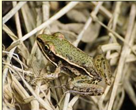
Southern Leopard Frog, Beanblossom Bottoms Nature Preserve, Monroe County, IN.