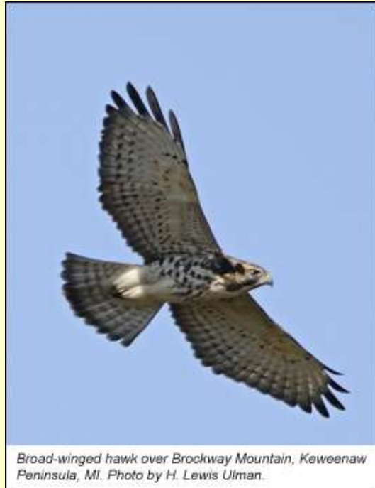
Broad-winged hawk over Brockway Mountain, Keweenaw Peninsula, MI.