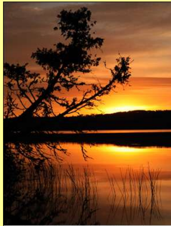
Sunset on Moskey Basin, Isle Royale National Park, MI.

Given our conference topic, "Species, Space, and the Imagination of the Global," it was no surprise that Animal Studies would top that list--a vibrant interdisciplinary field on the rise, with important overlaps but also interesting divergences from our own. Animal Studies as well as Food Studies, another new area, link concerns about