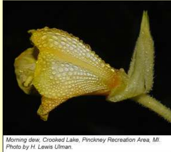
Morning dew, Crooked Lake, Pinckney Recreation Area, MI.

If there is one hard truth to the issues of diversity, it is that commitment to diversity rings truest when we are able to look around us and without hesitation know we are in a place vibrant with polyphony, where no matter what our discipline, gender, race, ethnicity, sexuality, age, or politics we feel comfortable being present, and know we can speak openly and listen attentively and carefully to the voices of others. ASLE's Diversity Caucus is a space to work towards this ideal, and to move forward towards common goals that we have conceptualized together. I look forward to the Executive Council Meeting in February and to all your contributions in the meantime.