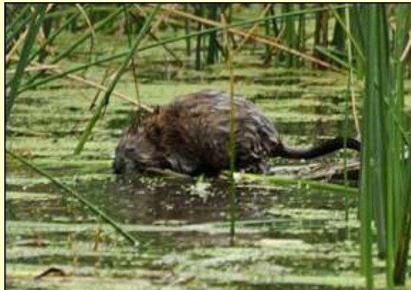
Muskrat at the Olentangy River Wetlands Research Park, Franklin County, OH.