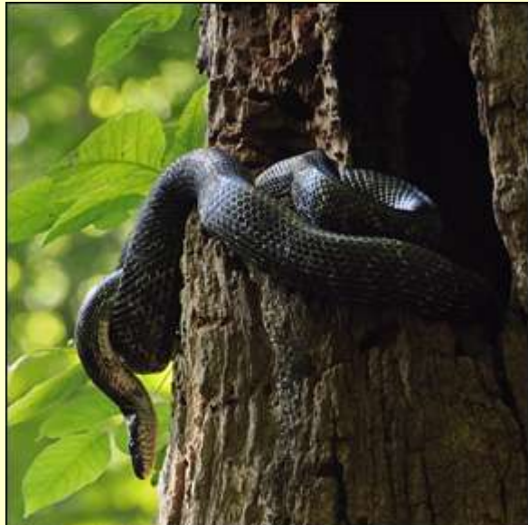
Black Rat Snake, Highbanks Metro Park, Delaware County, OH.

In Australia the mining boom is spawning a new environmental politics as farmers and environmentalists join forces to resist to expansion of new mines and coal seam gas projects. Issues of water, food security and access to land are key concerns, especially as significant areas of prime agricultural land are now coming under threat. Communities are 'locking the farm gate' to prevent exploration activities in sensitive areas, and are