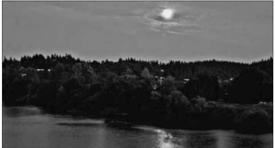
Moonrise over the Willamette River on June 21, the summer solstice and first day of the ASLE conference in Eugene, Oregon.