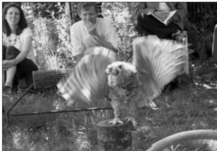
ASLE conference participants enjoy viewing a great horned owl up close while attending a field session at the Cascades Raptor Center in Eugene.