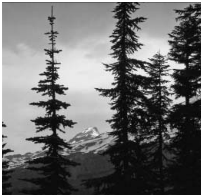
Pyramid Peak from the Pinnacle Peak Trail, Mt. Rainier National Park.

October 31, 2005. Food and the Literary Imagination. The Critic , the journal of the College English Association, is preparing this special issue. Topics are flexible and may include food as symbol; food and character or theme; food and ideology; conversation at meals; cultural preferences, taboos, and social roles; food and social currency; food and sexuality;