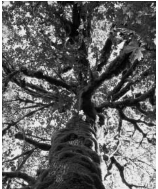
Old growth forest canopy; Fall Creek Trail, Oregon.